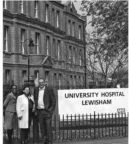
Greens say keep the NHS public